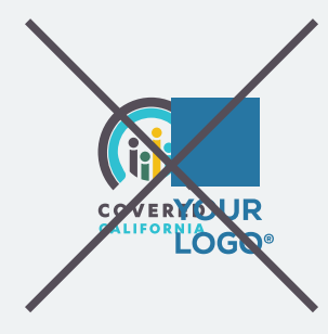
ARRANGEMENT Do not overlap the logos; follow white space rules.