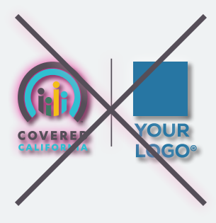
EFFECTS Do not add effects to the logo or logotype.