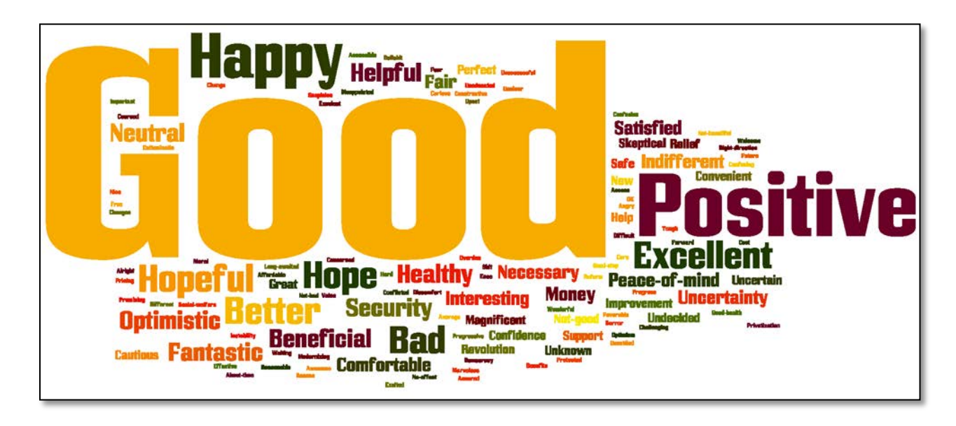
Figure 1: Word Cloud of One Word Summary of Health Care Changes

Respondents were asked to give one word that summarized their feelings about the upcoming changes. These responses reflect the general optimism about the Act among these respondents and are summarized in a "word cloud" in Figure 1 (larger text indicates the word was offered by more respondents but color and positioning are random).